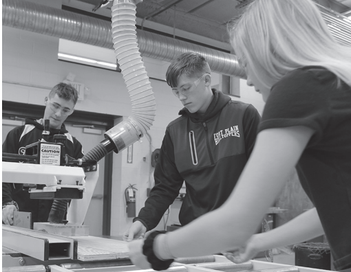
The Jr./Sr. High School Technology & Design class engineered and constructed a community closet this year. This resource gives students in need a place to get clothing and toiletries. Students said they were inspired to do their best as they gave back to their community in a project that provided real-world experience.